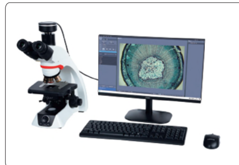
digital camera (supplied with software) and computer are optional